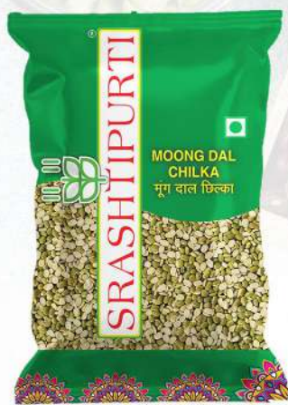
MOONG DAL (CHILKA)