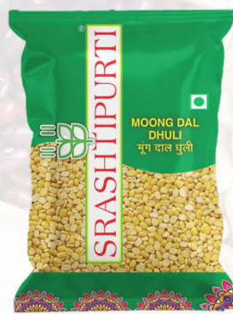
MOONG DAL (DHULI)