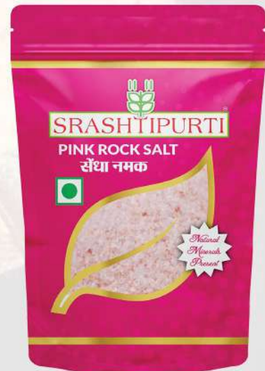
PINK ROCK SALT