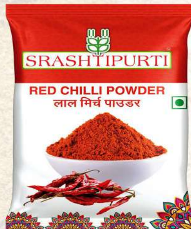
RED CHILLI POWDER